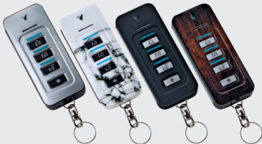
Metal Bubbles Black Wood