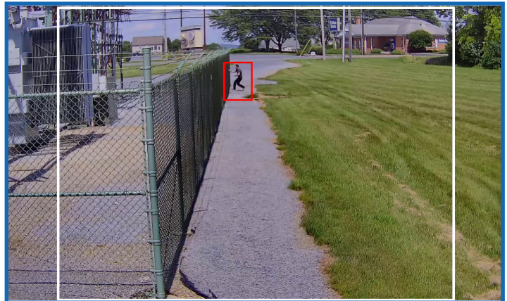
White border indicates thermal detection zone